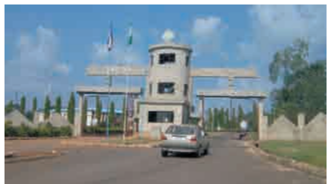
Plate 32. Entrance gate, Babcock University, Ilisan Remo, Ogun State.