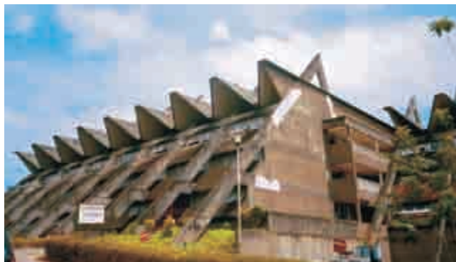
Plate 24. Civil Engineering Complex (Spider Building), Obafemi Awolowo University, Ile Ife.

There are four separate structures joined with a passage and void areas. The form arose from the need for having natural ventilation. The air reaches from the side and escapes out from the roof. The timber finishing of the roof structure adds to the pleasant environment within the building. The landmark Civil Engineering Complex by Niger Consultants has a form reminiscent of Egyptian architecture with the slanting prism-like expression, magnified even further by the repeated roof module [Plate 24]. The Faculty of Social Sciences with the aggressively projected roof slab and the repeated slanting columns gives the expression of an inverted pyramid. The overhanging slab acts as a sunshading device providing a lot of shadow for the elevation, thus demonstrating how pure modern architecture of simple basic forms can be adapted to the Nigerian climate.