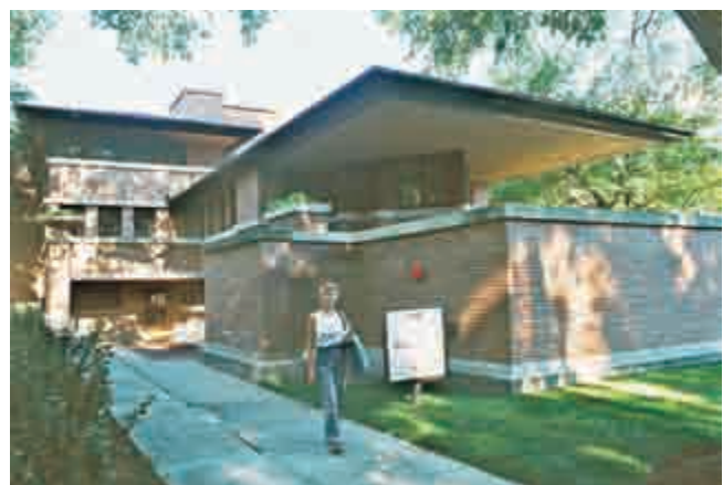
Plate 19. Robie House, University of Chicago, Chicago.

The universities have a policy of retaining and rehabilitating buildings of historic significance [Plate 19]. Historic buildings add architectural diversity to the campus and provide a tangible link to the past. The reuse of buildings also reduces the environmental impact of demolition and new construction. The historic buildings are preserved for university use. For example, Epperson Hall at UMKC is