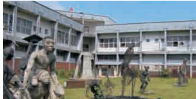
Plate 30. University Library, Delta State University, Abraka.