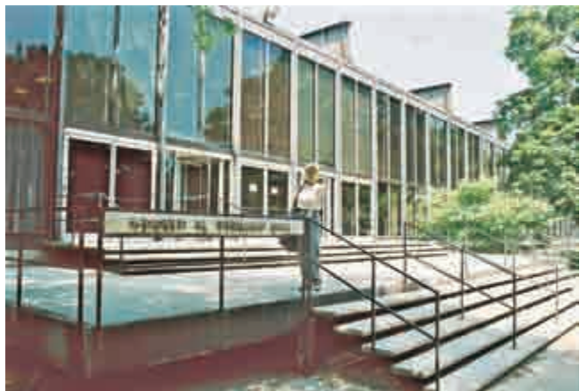
Plate 4. Grover Herman Hall, Illinois Institute of Technology,