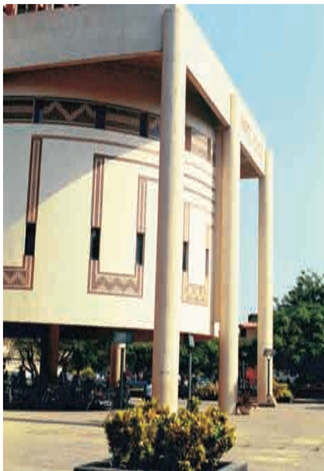
Plate 26. Senate Building, University of Lagos, Lagos.

The Faculty of Environmental Studies (2004) at Covenant University is a Late Modern building. It still uses a parapet wall but the presence of the roof is obvious. The building is adorned by vertical strips of windows with reflective glass and a well celebrated entrance with a semi-transparent vault. John Hall (2002) is a student hostel in the same style [Plate 28]. The late modern style is also evident at the Benue State University, with new buildings more compatible with the climate [Plate 29]. The University Library at the Delta State University, Abraka is in the international style but the use of landscaping including trees and the introduction of a sculpture garden containing works by students give the building character [Plate 30]. The same applies to the School of Environmental Studies at the Ambrose Alli University, Ekpoma [Plate 31]. The buildings at the main campus of the Delta State University are mainly late-modern and postmodern buildings, but with the influence of low-trop architecture still visible. A similar