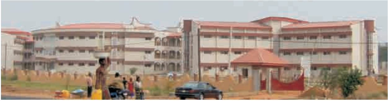
Plate 29. New Buildings at the Benue State University, Makurdi.

tendency can be found in new buildings at the Ambrose Alli University, Ekpoma. Babcock University is a famous private university [Plate 32].