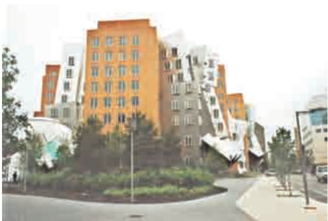
Plate 5. Stata Centre. Massachusetts Institute of Technology, Boston.