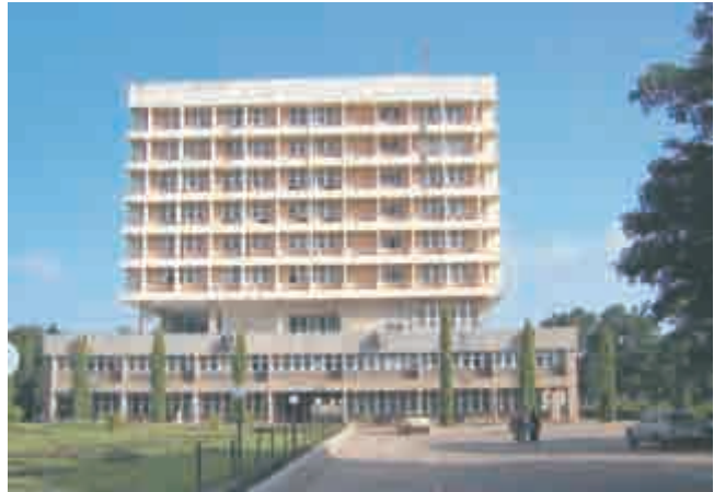
Plate 22. Senate Building, Ahmadu Bello University, Zaria.

The hexagonal twin lecture theatre (FASS Theatre) by Niger Consultants is one of the most attractive structures on the campus. The building is surrounded by green areas and stands like a monument. The architects utilized shadow effects on elevation well. This characteristic building is very popular despite some obvious functional problems. The Senate Building by Egbor and Associates is the tallest building within the campus [Plate 22]. Looking at the building from the outside one can hardly expect that there is a Senate Chamber hanging just on top of the entrance hall. On top of the Senate Chamber is a nice atrium.