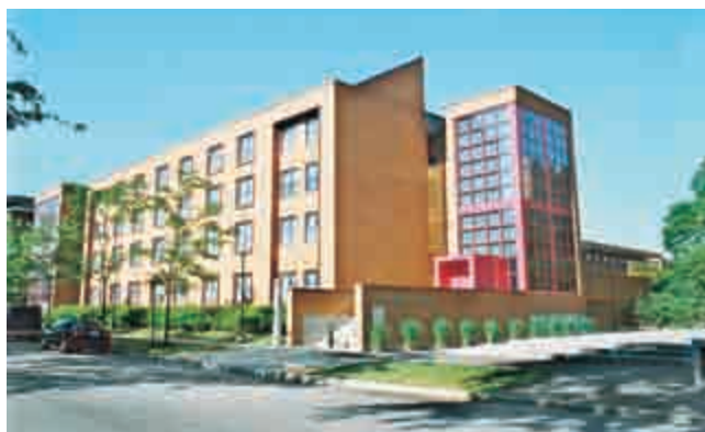
Plate 12. Student Hostels at University of Chicago.

Also at IIT main campus there is the spacious McCormick Student Village - a residence hall complex for the students. The hostels are accommodated in the traditional buildings like at Harvard University or very fashionable Post Modern buildings like at the University of Chicago [Plate 12].