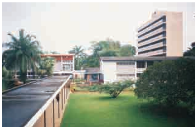
Plate 27. Students' Hostel, Kwame Nkrumah University of Science And Technology, Kumasi, Ghana.