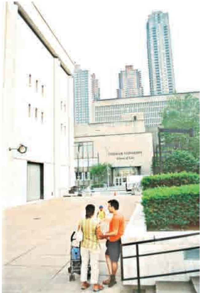
Plate 9. Fordham University, New York.