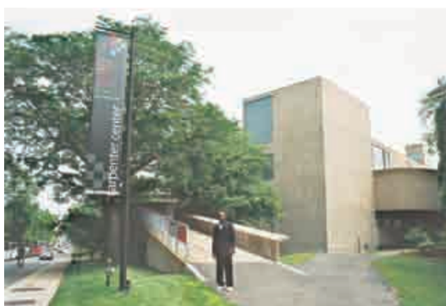
Plate 13. Carpenter Centre for the Visual Arts, Harvard University.

The most famous buildings are designed by world-renowned architects. Although many of these architects are Pritzker prize winners, they usually strive to produce unique and interesting designs for these university campuses. They know that a successful project on campus will enhance their fame and popularity. The landmark buildings used as case studies are the Harvard Carpenter Centre for the Visual Arts, the Harvard Graduate School of Design, Architecture and Planning, the IIT University Centre, the MIT Stata Centre and the Stowers Medical Research Centre.