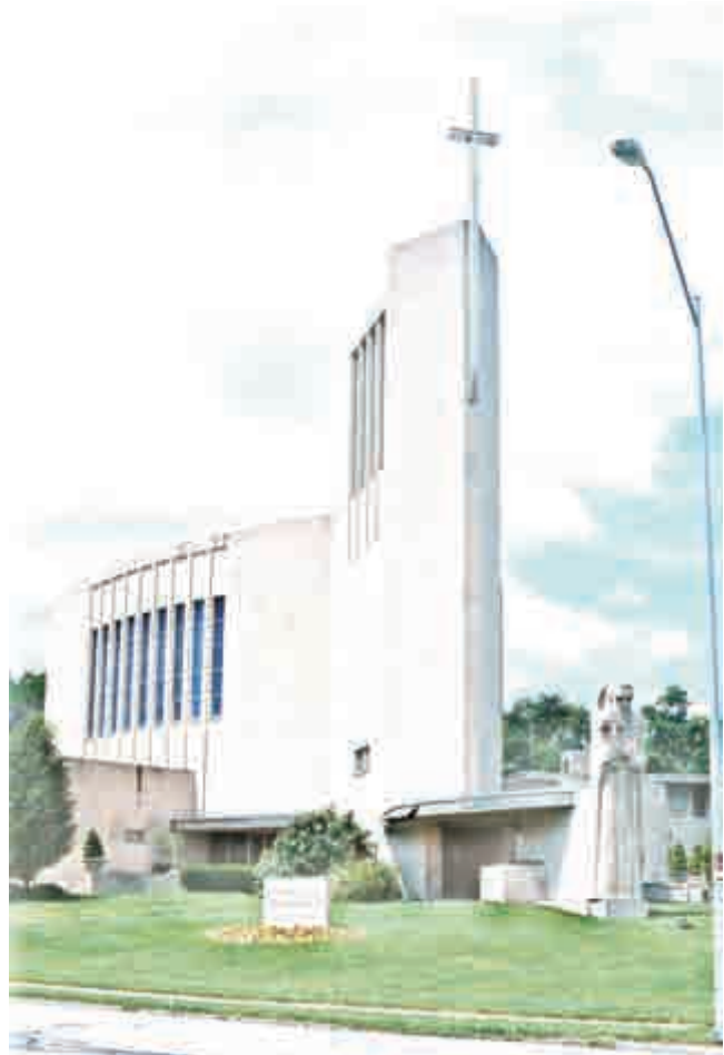
Plate 11. St Francis Xavier Catholic Church, University of Missouri, Kansas City.

There is an expectation that a church should be monumental to host its religious function due to the long tradition of historical churches. This is fulfilled in some cases by the modern architects. In some other instances they used box-like anonymous forms which in the opinion of the researchers are not the best for the purpose. They are good however in demonstrating the changing fashion in architecture like for example the Robert F. Carr Memorial Chapel of St. Savior (1952) at IIT. It is the only ecclesiastical building ever completed by Mies van der Rohe. It is 11m wide, 18m long, and 6m high. Its walls are constructed of buff brick with interior partitions of natural finished oak. This building does not reflect the religious function on the exterior in anyway. It looks like any other building on the campus. Even the interior is just an open hall like other Miesian's open space interiors. St Francis Xavier Catholic Church (1951) at UMKC has a sculpture-like, monumental shape with the cross on the tall bell tower in front [Plate 11]. It can be compared to the shape of a boat or to "praying hands". The interior is very pleasant especially because of the sapphire blue color of the stained glass. The light that comes in through the narrow, tall, vertical windows makes it appear mystical. Its form goes well with the Revival of Radical Individualism as represented by the pilgrim church at Ronchamp by Le Corbusier.