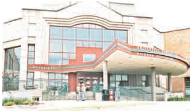
Plate 8. Pierson Auditorium, University of Missouri, Kansas City.