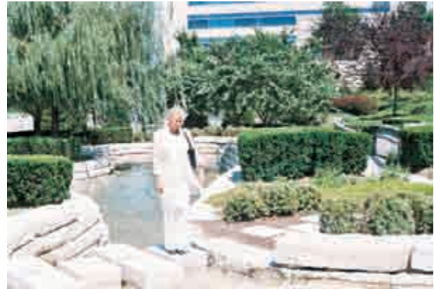
Plate 18. Garden at the Stowers Institute for Medical Research, University of Missouri, Kansas City.

The landscape design plays an indispensable role in campus planning. It relates to circulation and recreation. It supplements the architecture and creates a visual pleasure [Plate 18]. It consists of the ground finish with pavements; concrete tiles, brick, stone or gravel finish with terrain steps, grass lawns, and pools of water. Others are vertical elements, seating arrangements, elevated flower beds, retaining walls, fencing materials, fountains, sculptures, small scale free standing structures like gazebos and plants including trees, shrubs, herbs and climbing plants. Along with buildings, landscaping is responsible for the skyline, the views, vistas and the way the sky vault appears.