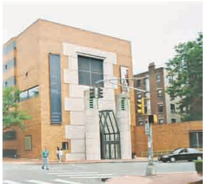
Plate 3. Sackler Museum. Harvard University.

The Massachusetts Institute of Technology campus is a modern conglomerate of buildings, most famous of which is the Stata Centre by Frank Gehry [Plate 5]. This quiet yet busy campus is home to several world class schools, laboratories and research institutes, including the School of Architecture. The campus is intersected by major urban roads, but there is no definite boundary separating the campus from the other buildings. There is free bus transport within the campus and a large shopping mall complete with specialty shops, grocery stores, restaurants and services.