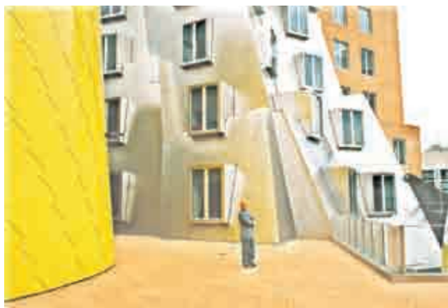
Plate 16. Stata Centre, Massachusetts Institute of Technology, Boston.

The fitness centre has facilities for aerobics, weight training and a dance studio. There is a direct link from the Fitness Centre to the Alumni Swimming Pool. The building also has a Childcare Centre with a playground and a designated drop-off area. The building is designed to maximize the use of natural lighting. This is enhanced by a series of glass walls and roof lights. The building uses raised floors with a modular electrical system, phone and data networks and a displaced air system. The Stata Centre is environmentally friendly, with a storm water management system and pumps powered by solar panels. Water from the roofs is collected in underground cells and used for flushing toilets. A series of interconnected plazas and gardens provide extensive outdoor space. Completely hidden underneath the building is a 700-car underground garage.