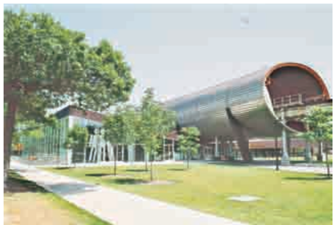
Plate 15. McCormick Tribune Campus Centre, Illinois Institute of Technology, Chicago.

The McCormick Tribune Campus Centre is strategically located at the centre of the Illinois Institute of Technology campus. This appealing design is the work of Pritzker Prize winning architect Rem Koolhaas based in Rotterdam [Plate 15]. The design concept arranges various areas around diagonal pathways, with a concrete and stainless steel tube that encloses an elevated section of the city mass transit railroad. This tube dampens the noise of the trains overhead. The building houses services that had hitherto been scattered all over the campus: food courts, retail shops, student organization offices, a recreational facility and space for campus events. This is the first building completed by Koolhaas in the United States.