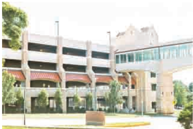
Plate 20. Multi-storey car park with bridge at the University of Missouri, Kansas City.

The distinct and elegant look of first generation Nigerian universities is associated with the flamboyant economy of the country of the seventies [Plate 21] and in the case of the younger universities with the rational thinking of