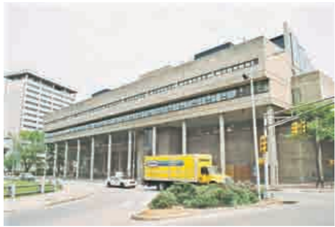
Plate 14. Harvard Graduate School of Design, Architecture and Planning, Harvard University.

the students work in the same stepped studio space. The entire studio is evenly and very well lit by the sky lights. There are long space rafters that span across the width of the studio and support the weight of the sky lights. The ground floor with the reception and a conference hall has a lot of exhibition space for students' works. There is free access around the building allowing easy pedestrian circulation. The cantilevered front area with horizontal window bands has offices for 100 faculty and staff. The pillars visible on the front elevation span three floors while on the side elevation their height changes according to the studio level. The studio wall is projected in a way that the side elevation perfectly exposes the levels used for the studio.