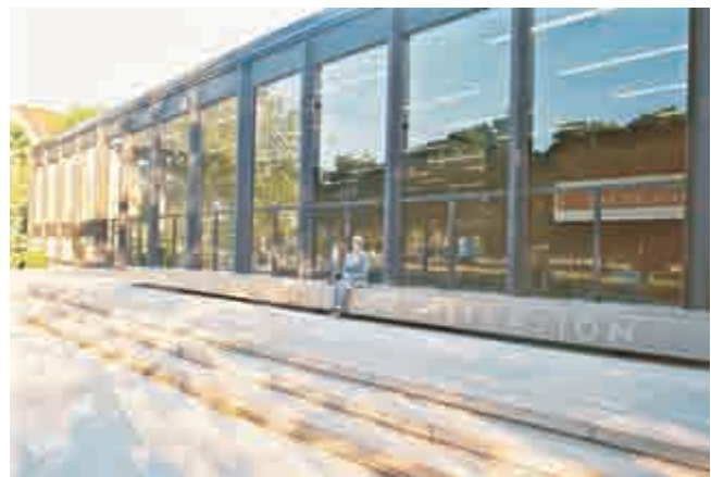
Plate 7. School of Social Service Administration, University of Chicago, Chicago.