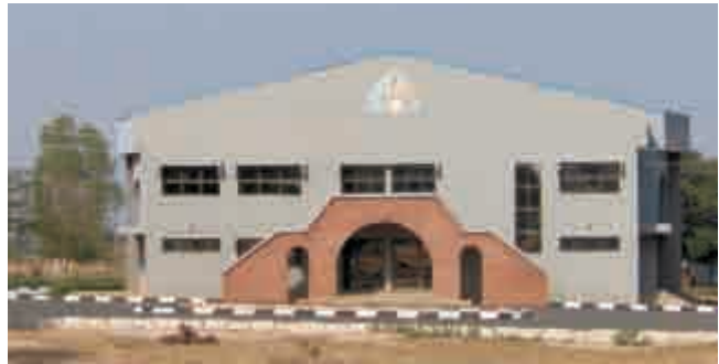
Plate 34. Multipurpose Hall, Federal University of Technology, Yola.