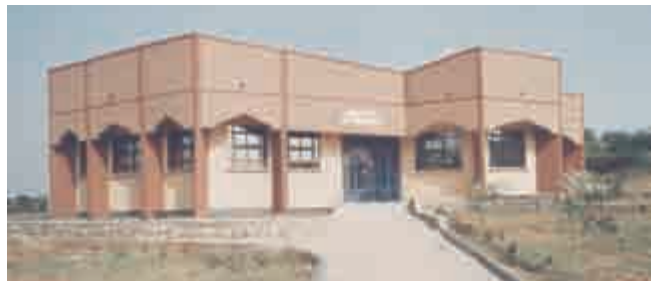
Plate 23. CBN-FUTA Computer Resource Centre, Federal University of Technology, Akure.

The Senate Building by Ahime Associates has a pleasant exterior and is in harmony with the landscaped environment. The CBN-FUTA Computer Resource Centre (2004) by the Authors is a unique building designed on a honeycomb grid with a characteristic outline of the parapet walls [Plate 23]. The building is climate sensitive and is well protected from rain and sun glare. It has an oblique courtyard which also acts as a passage hence there are two well linked entrances. The Chancellor's, Pro Chancellor's and Vice Chancellor's Lodges were designed by the Authors on the same principle of a square plan with a concentric square courtyard. The diagonally positioned entrance porches give the buildings a unique appearance. The School of Mines and Earth Sciences is a building very sensitive to the local conditions. It is designed on a sloping site and it smartly incorporates the change of levels. The National Fellowship of Catholic Students (NFCS) Lodge looks like a cross in plan.