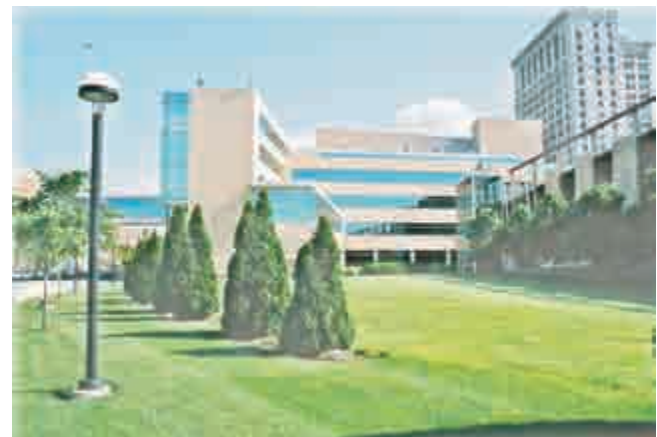
Plate 2. Cleveland State University.

The University is located at the centre of the city and is made up of a series of interconnected buildings, some of which are linked by an overhead bridge. A pleasant system of walkways, lawns, trees and flowerbeds give the campus its characteristic park atmosphere. The surrealistic blue sky works well with the glass to create palpable euphoria. [Plate 2].