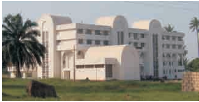
Plate 33. Senate Building, Kogi State University, Akungba.

This paper has shown that university campuses have unique architectural character. This architectural character and urban design contribute immensely to the success and popularity of universities. University buildings feature a blend of old and new architectural styles, with historic landmarks sharing the stage with modern facilities. The landscape is highly valued and the visual structure of interconnected landscaped areas often form passages, thus reinforcing the universities' physical identity. Concentrating parking in strategically located structures frees up