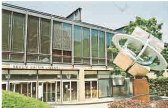
Plate 10. Paul Galvin Library, Illinois Institute of Technology, Chicago.