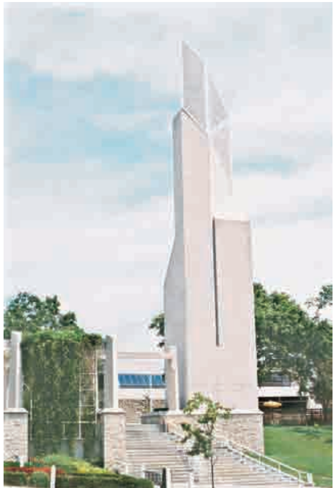
Plate 6. Rockhurst University, Kansas City, Missouri.

The Henry Hinds Laboratory for the Geophysical Sciences is a well articulated building with a well defined entrance and some sophisticated postmodern details. The Students' Hostel has good proportions, beautiful color scheme and postmodern toy-like appearance enhanced by carefully designed landscaping elements. The high-technology sports hall uses white pylons with suspension and tension cables.