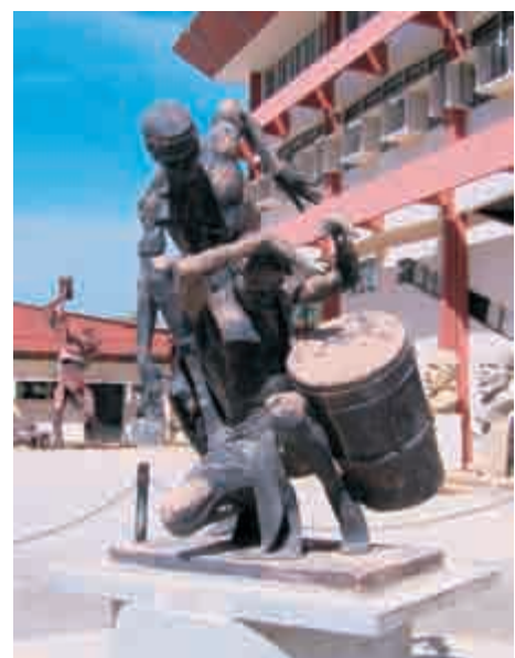
Plate 21. Sculpture at Department of Fine Arts, Ahmadu Bello University, Zaria.