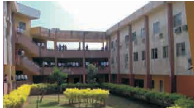
Plate 31. School of Environmental Studies, Ambrose Alli University, Ekpoma.