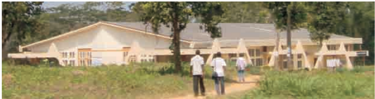
Plate 35. Postmodern elements in a low-trop building at the Olabisi Onabanjo University, Ago Iwoye.

land and provides convenient access to campus facilities. In the planning aspect the relationship with the town is very essential and in a way the town is brought to the campus. The universities try to be an integral part of downtown. In the Nigerian context the Universities still remain in isolated spaces maintaining the old model which needs to be reexamined.