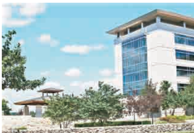
Plate 17. Stowers Medical Research Centre, University of Missouri, Kansas City.

The Stowers Medical Research Center (2000) by Peckham Guyton Albers & Viets Inc. and MBT Architecture is dedicated to research on cancer patients [Plate 17]. It has the beauty and character that directly responds to its mission statement: "Hope for Life". The complex can easily capture passers-by attention by its beautiful form, rich landscape and quality of details. In a way it is reminiscent of Prairie house buildings by Frank Lloyd Wright especially in the design of the roof and the last floor, the linear treatment of finishes of the ground floor and the elongated wall with falling water and the general attention paid to details. The elevation uses warm light brown colour and is finished to resemble natural granite stone. Most windows on the elongated elevations are in horizontal bands while on the short elevations there are big windows occupying nearly half the wall surface. The overall result is very pleasant and enchanting. The design is further enhanced by the landscaping features including a small garden setting with a gazebo, water bodies with fountains and sculptures. The contrasting dark green plants also have a