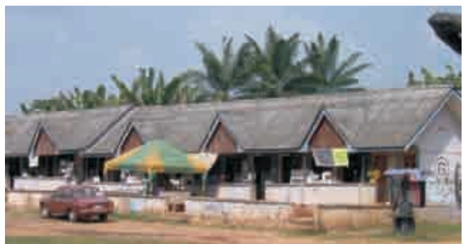
Plate 36. Shopping mall, University of Benin, Benin City.

land and provides convenient access to campus facilities. In the planning aspect the relationship with the town is very essential and in a way the town is brought to the campus. The universities try to be an integral part of downtown. In the Nigerian context the Universities still remain in isolated spaces maintaining the old model which needs to be reexamined.