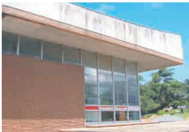
Plate 25. University Bookshop, University of Ibadan, Ibadan.

The Conference Centre has a nice atmosphere created right from the entrance area. The big complex houses many facilities including a conference hall, restaurant, and a hotel with a beautiful rock garden. The entrance courtyard of the conference hall takes care of many activities. It links the smaller seminar rooms and leads to the main hall. The garden atmosphere created here is very suitable for the pre- and post-conference activities. The arrangement of the conference hall is based on concentric squares.