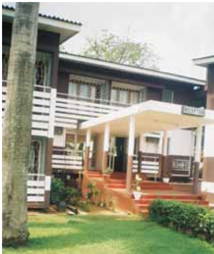
University of Ibadan, Ibadan. Conference Centre.