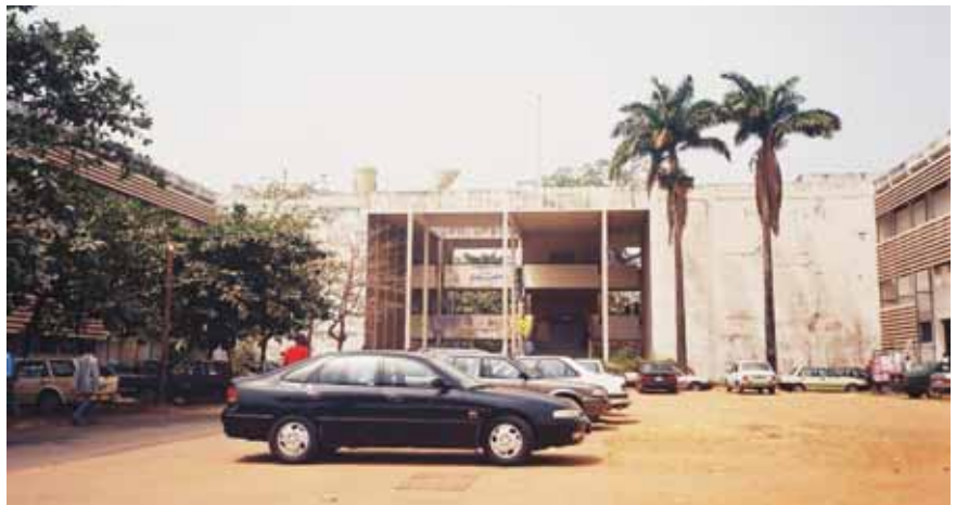
Obafemi Awolowo University, Ile-Ife. Faculty of Science main entrance. Source: author's photograph, 2004.