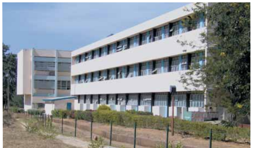
Ahmadu Bello University, Zaria. Institute of Education.