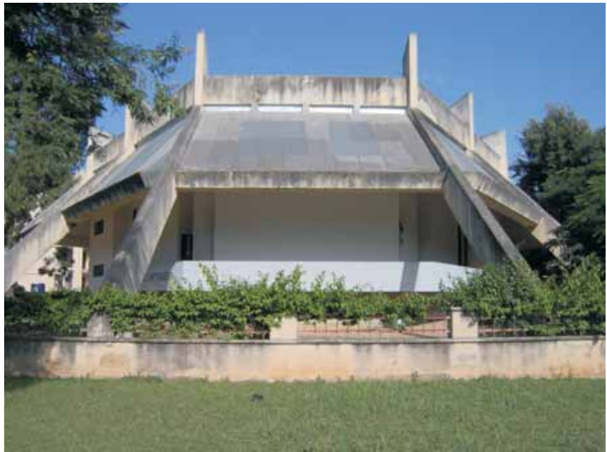
Ahmadu Bello University, Zaria. Twin lecture Theatre.