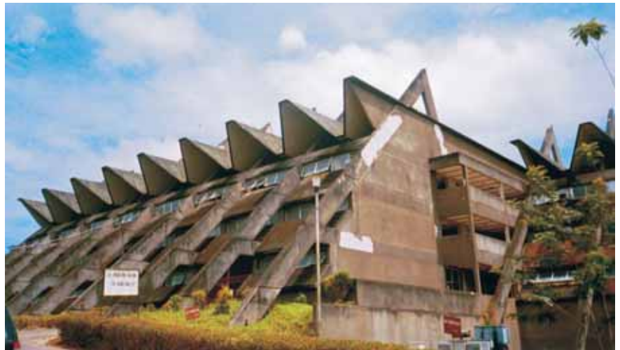
Obafemi Awolowo University, Ile-Ife. Spider building housing the Department of Civil Engineering.

The landmark Civil Engineering Complex by Niger Consultants has a form reminiscent of Egyptian architecture with the slanting prism-like expression, magnified even further by the repeated roof module.