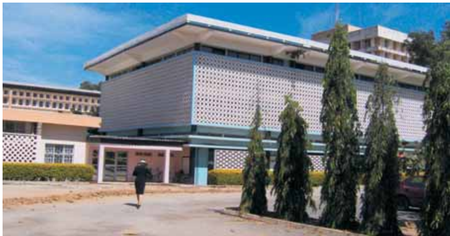
Ahmadu Bello University, Zaria. Administrative Buildings.