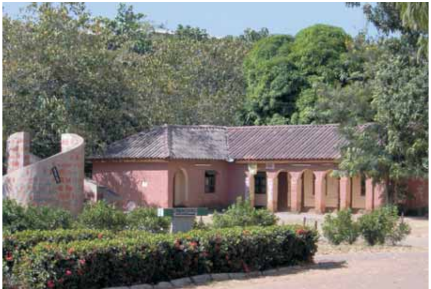
Ahmadu Bello University, Zaria. Demonstration stabilized earth building adjacent the Department of Architecture.