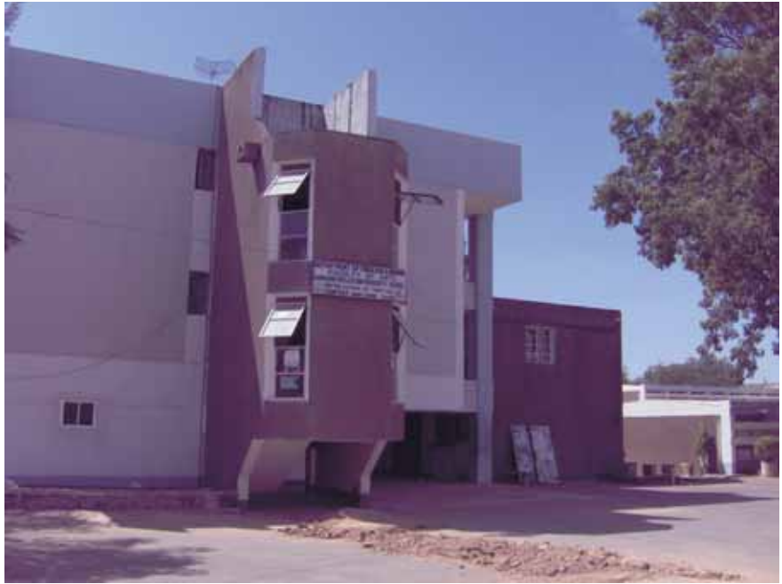
Ahmadu Bello University, Zaria. Staircase, Faculty of Arts and Social Sciences.