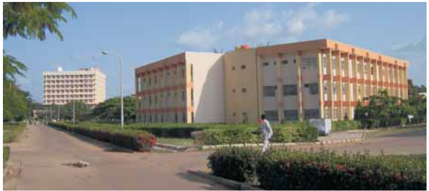
Ahmadu Bello University, Zaria. Department of Fine and Applied Arts.