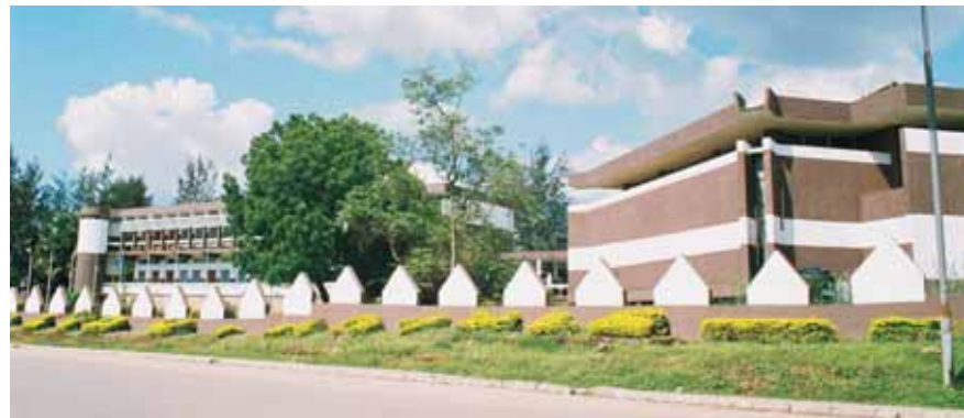
University of Ibadan, Ibadan. Conference Centre.