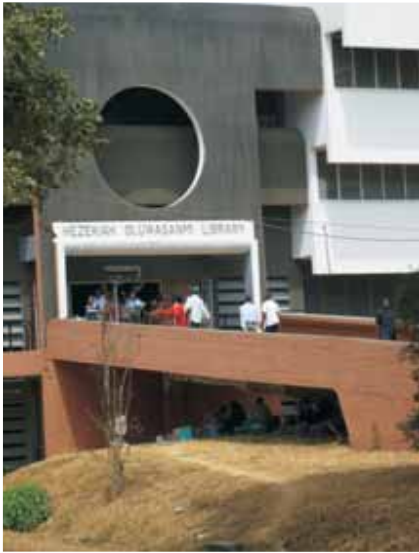
Obafemi Awolowo University, Ile-Ife. University Library.