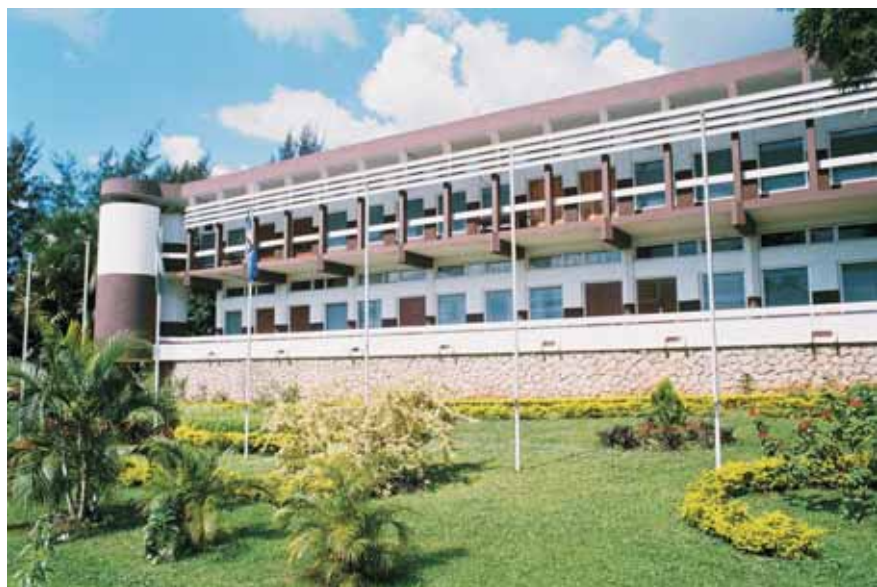
University of Ibadan, Ibadan. Conference Centre.