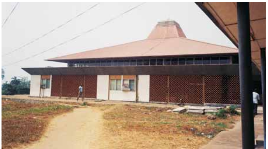
Obafemi Awolowo University, Ile-Ife. Department of Architecture formerly Central Cafeteria.