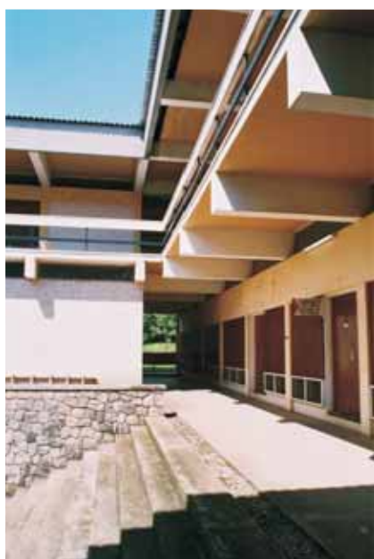
University of Ibadan, Ibadan. Department of Nursing courtyard.