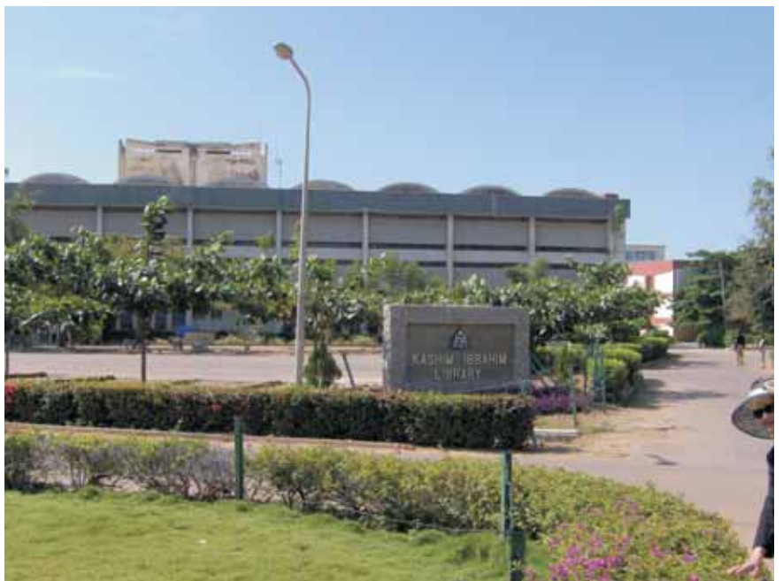
Ahmadu Bello University, Zaria. Kashim Ibrahim Library.