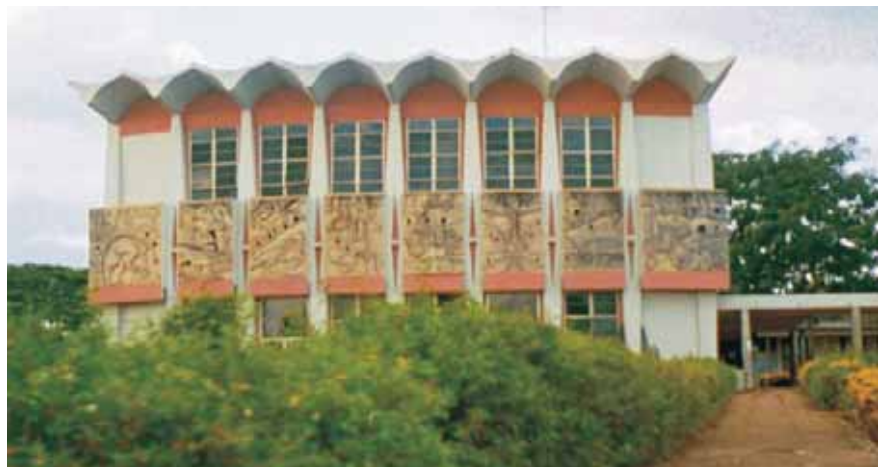
University of Ibadan, Ibadan. Department of Linguistic Arts.