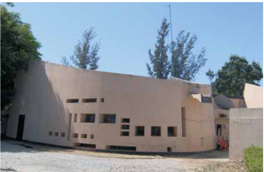
Ahmadu Bello University, Zaria. Staff Club.