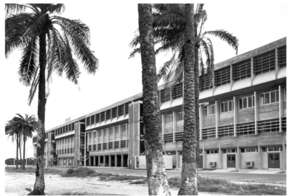
UNLAG Science Complex