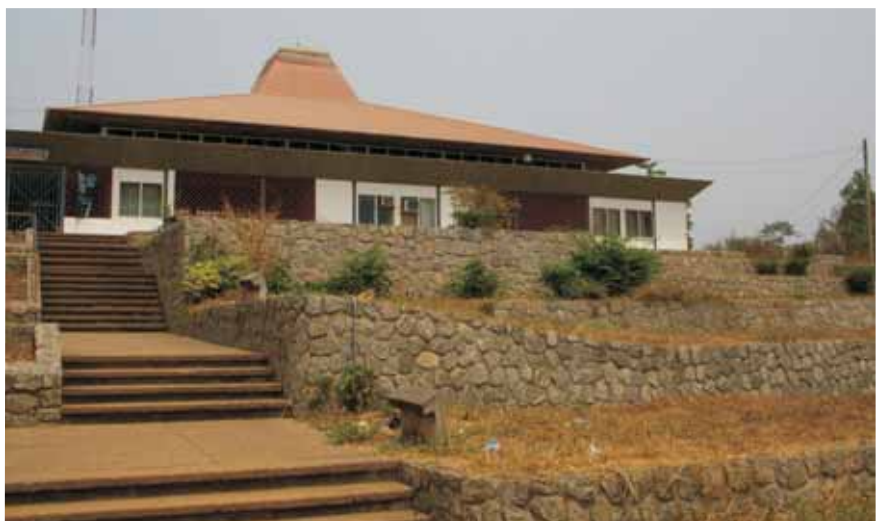
Obafemi Awolowo University, Ile-Ife. Department of Architecture formerly Central Cafeteria.