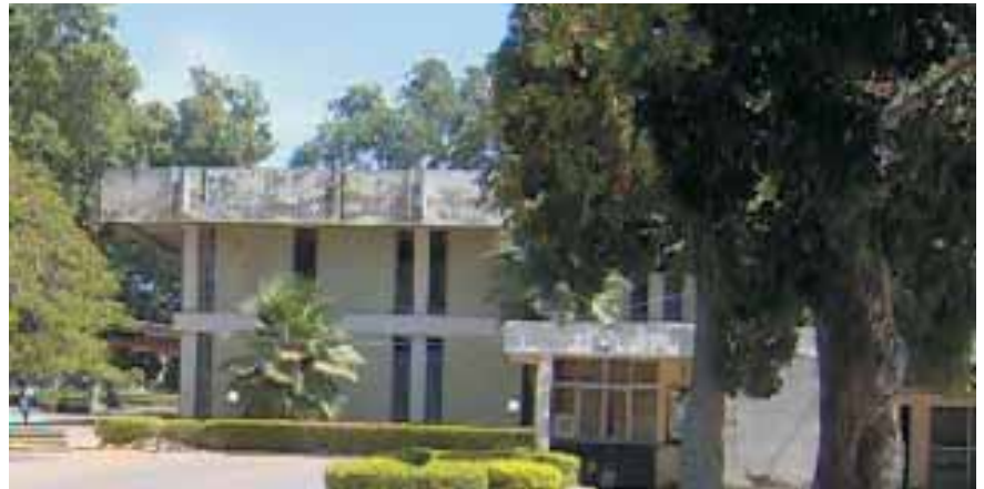
Ahmadu Bello University, Zaria. University Bookshop.