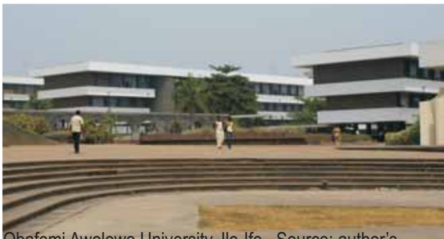
Obafemi Awolowo University, Ile-Ife.