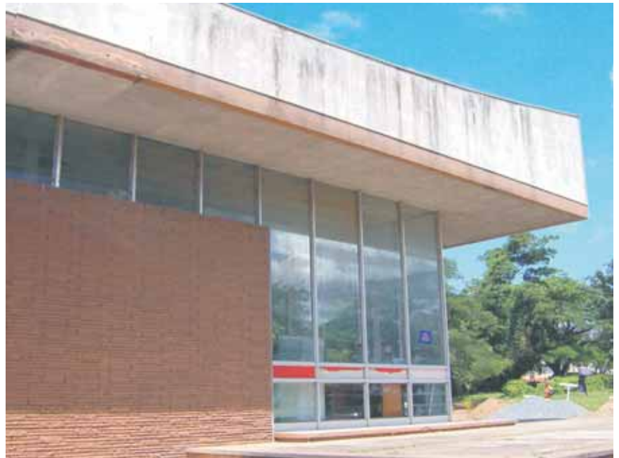
University of Ibadan, Ibadan. University Bookshop.

The University Bookshop (1960's) was designed by Design Group Nigeria. This building is the most characteristic building of the International Style in Nigeria. It consists of a simple geometric form and exposed parapet wall with typical curtain walls and perfect precision of detail.