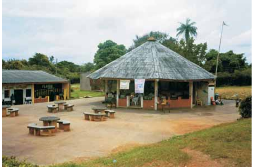
Obafemi Awolowo University, Ile-Ife. Shopping complex with restaurants and services.