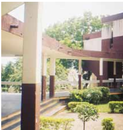
University of Ibadan, Ibadan. Conference Centre.