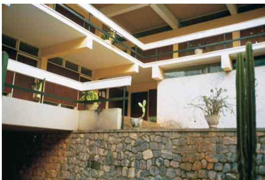
University of Ibadan, Ibadan. Department of Nursing.