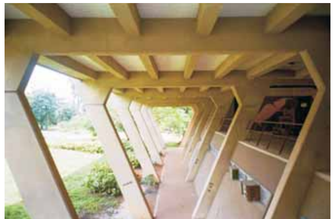
Obafemi Awolowo University, Ile-Ife. Faculty of Social Science ground floor detail.