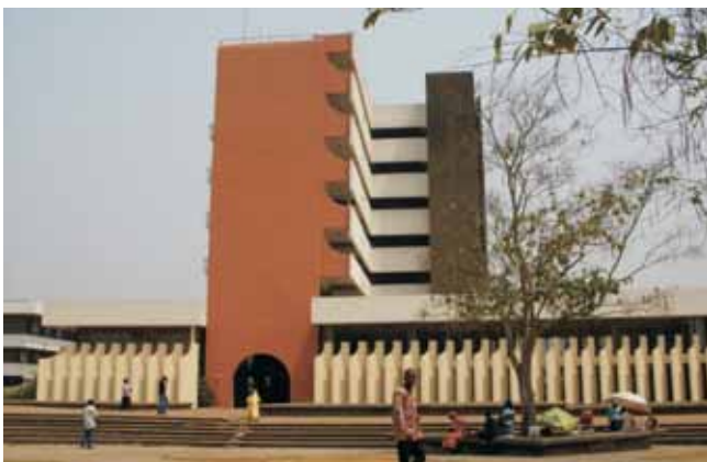
Obafemi Awolowo University, Ile-Ife.