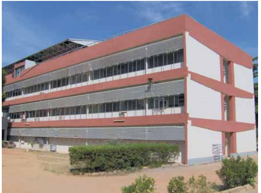
Ahmadu Bello University, Zaria. Department of Architecture.