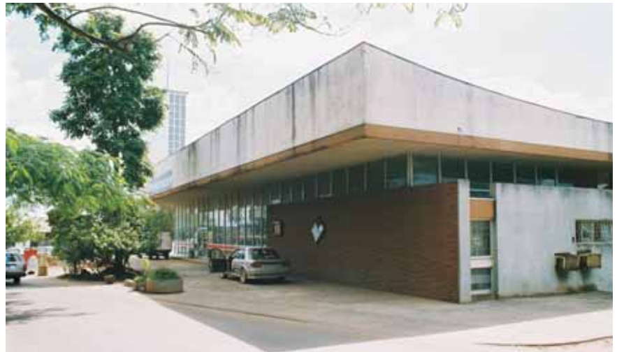
University of Ibadan, Ibadan. University Bookshop.