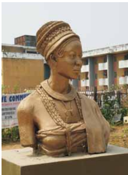
Obafemi Awolowo University, Ile-Ife. Moremi Hall.