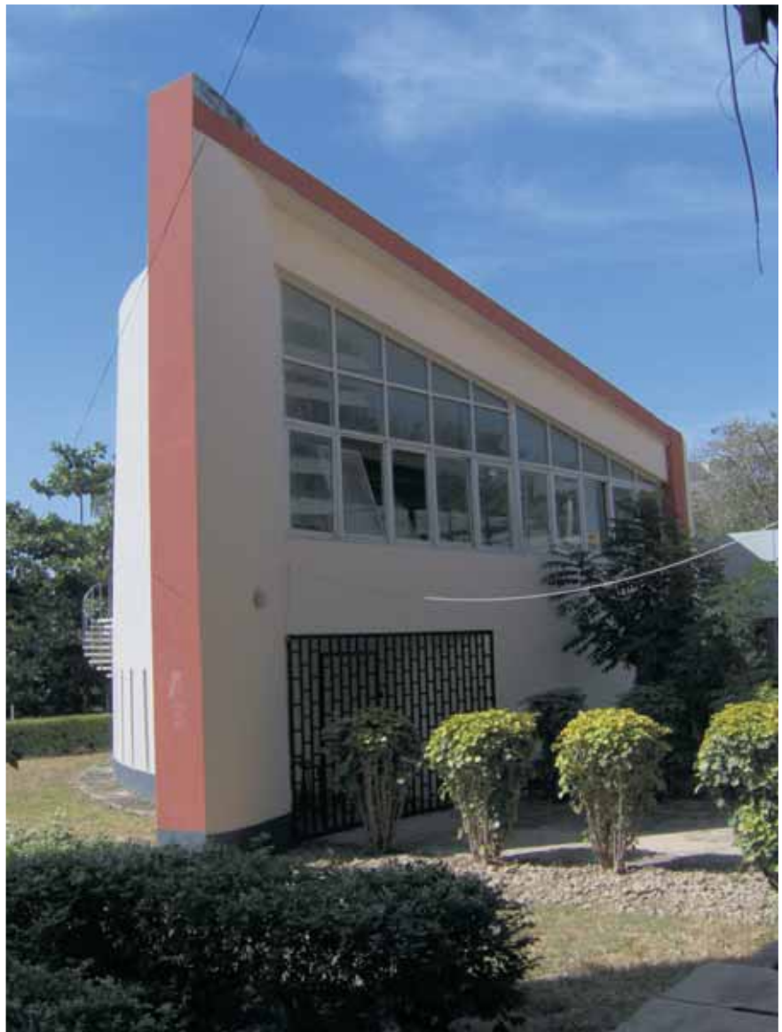
Ahmadu Bello University, Zaria. Lecture Hall, Faculty of Environmental Sciences.