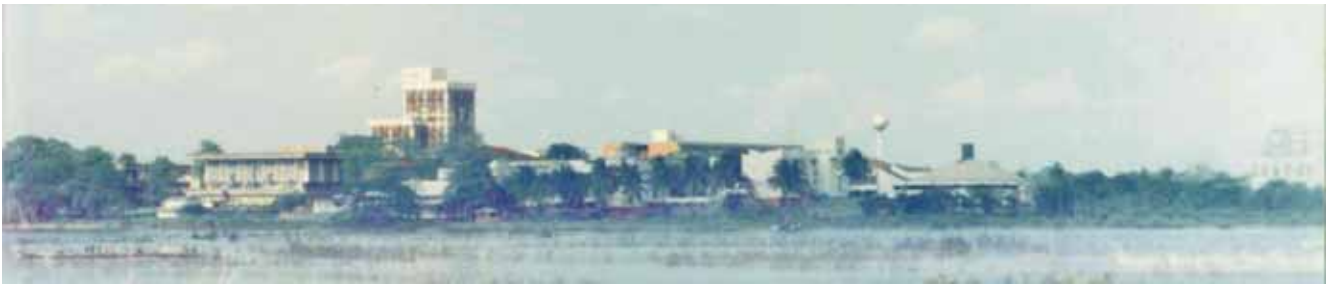
Panorama of the University from the 3rd Mainland Bridge.