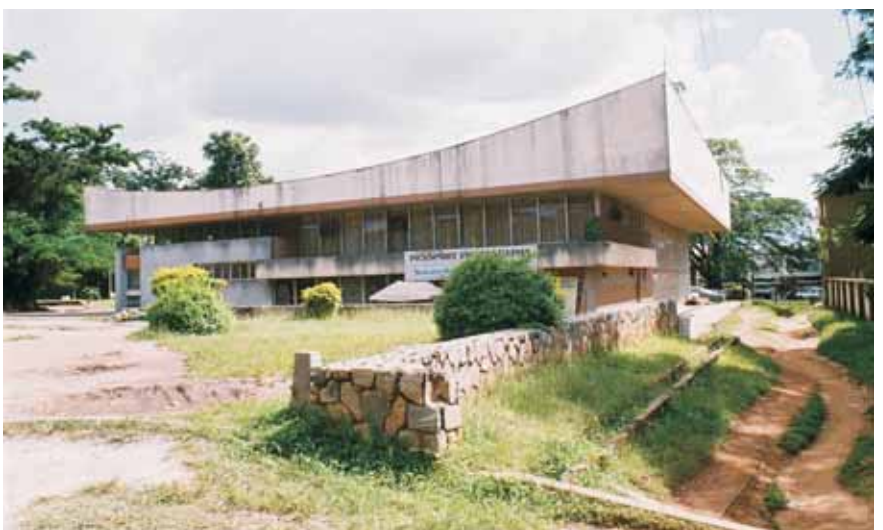
University of Ibadan, Ibadan. University Bookshop.