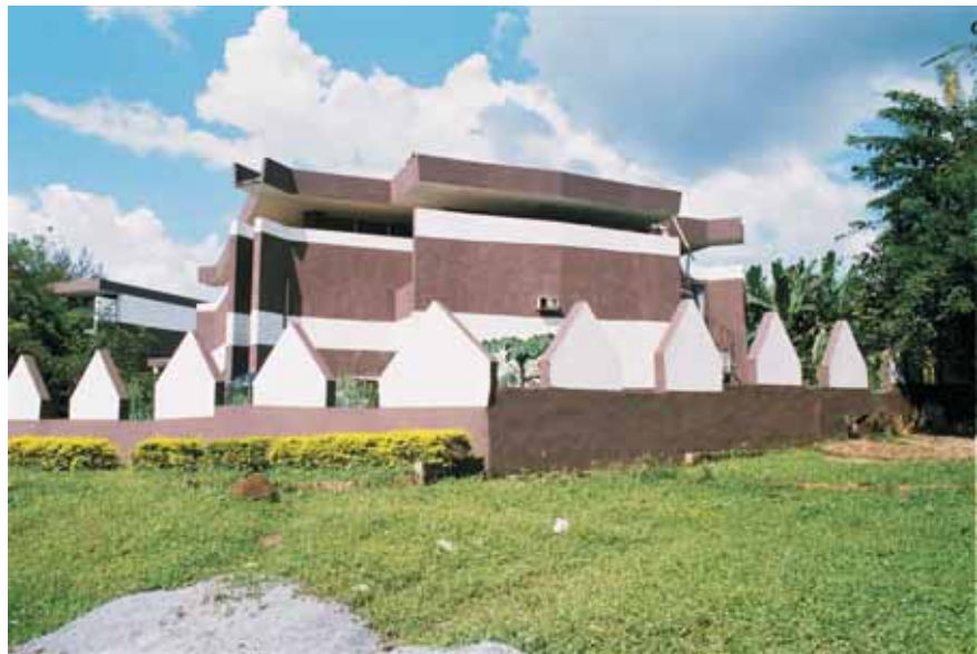
University of Ibadan, Ibadan. Conference Centre.

The Conference Centre has a nice atmosphere created right from the entrance area. The big complex houses many facilities including a conference hall, restaurant, and a hotel with a beautiful rock garden. The entrance courtyard of the conference hall takes care of many activities. It links the smaller seminar rooms and leads to the main hall. The garden atmosphere created here is very suitable for the pre- and post-conference activities. The arrangement of the conference hall is based on concentric squares.