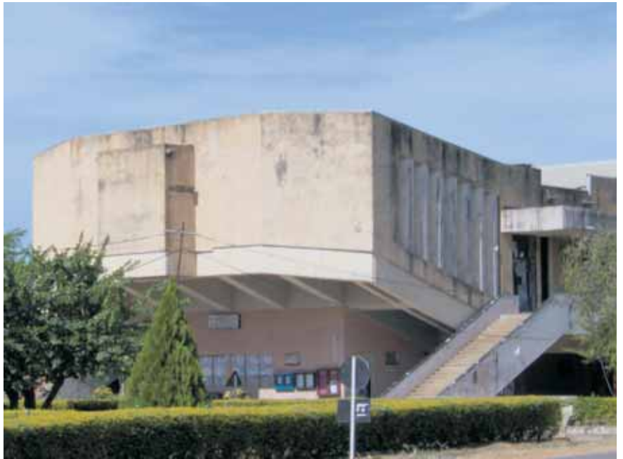
Ahmadu Bello University, Zaria. School of Basic Studies Lecture theater.