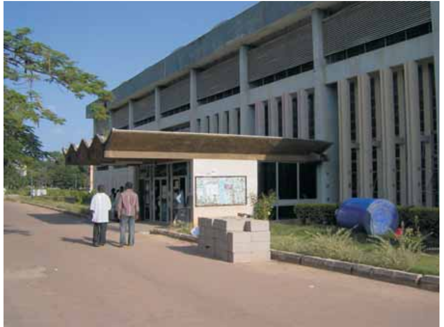
Ahmadu Bello University, Zaria. Kashim Ibrahim Library.