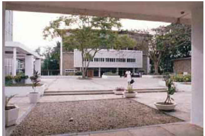
University of Ibadan, Ibadan. Trenchard Hall.