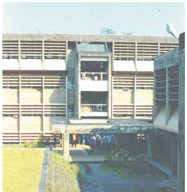
Faculty of Science.