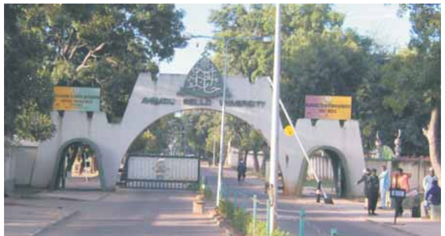
Ahmadu Bello University, Zaria. Main entrance gate to university.