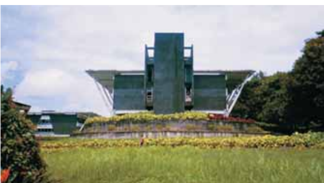
Obafemi Awolowo University, Ile-Ife.