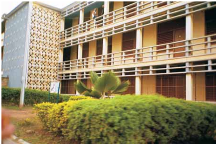
University of Ibadan, Ibadan.