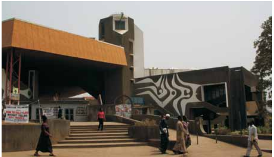
Obafemi Awolowo University, Ile-Ife. Oduduwa Hall.

Oduduwa Hall by AMY is a very interesting building that stands out as a unique icon. It has many public ambiguous spaces while the air penetrates freely through the zoning and the visual aspect carefully considered. The building is well detailed and the choice of colours makes it even more intriguing and dynamic. The open amphitheatre (now covered) and the well composed landscape enhance its beauty even further.