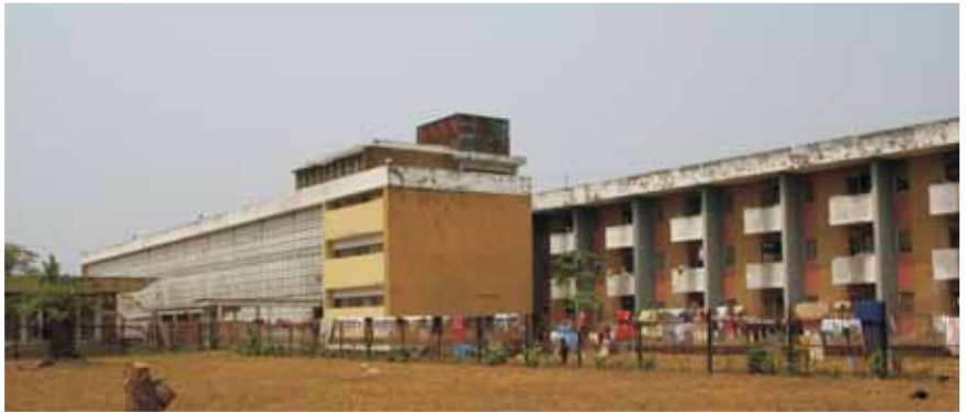
Obafemi Awolowo University, Ile-Ife. Moremi Hall.