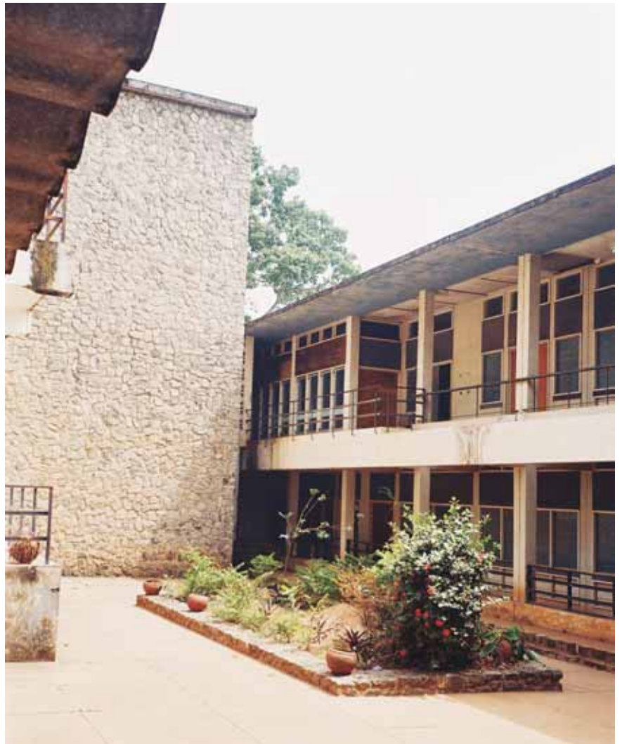
Geology Department, University of Ibadan, Ibadan.