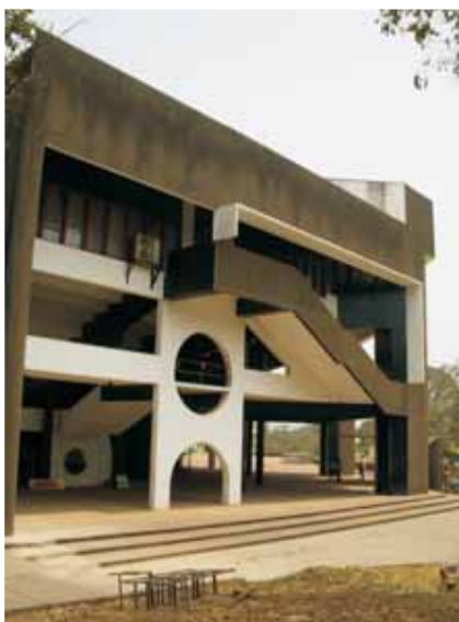
Obafemi Awolowo University, Ile-Ife. Oduduwa Hall.