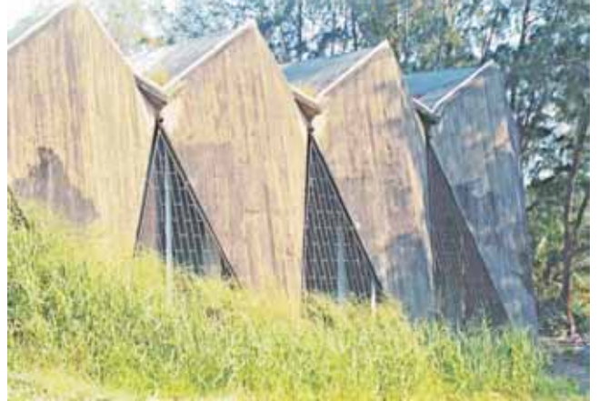
Faculty of Science Lecture Hall.