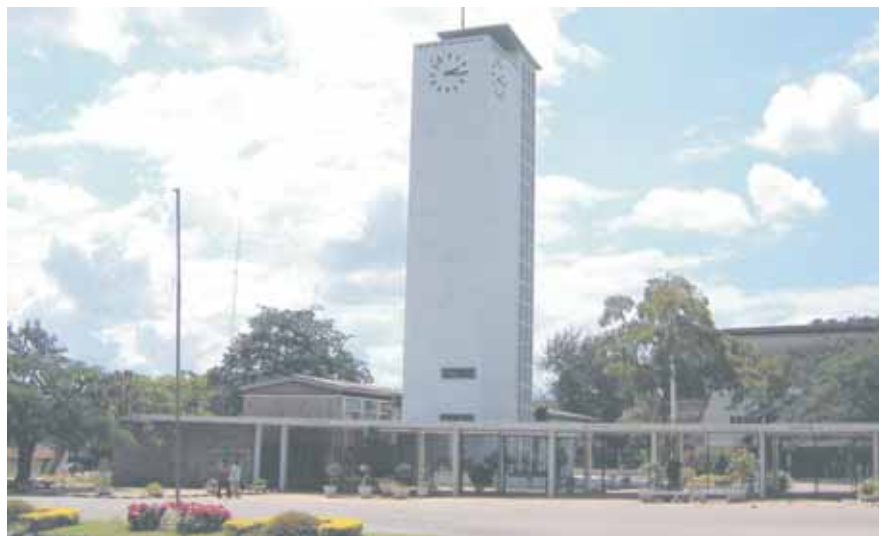
University of Ibadan, Ibadan. University tower.