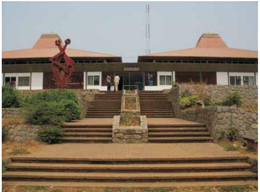
Obafemi Awolowo University, Ile-Ife. Department of Architecture formerly Central Cafeteria.

The Department of Architecture previously Central Cafeteria (1976) was designed by Design Group of Nigeria . There are four separate structures joined with a passage and void areas. The form arose from the need for having natural ventilation. The air reaches from the side and escapes out from the roof. The timber finishing of the roof structure adds to the pleasant environment within the building.