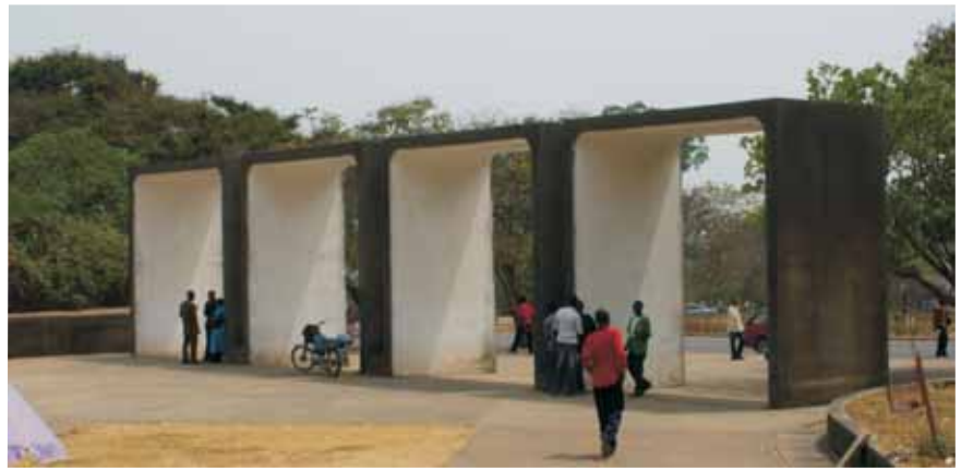
Obafemi Awolowo University, Ile-Ife.