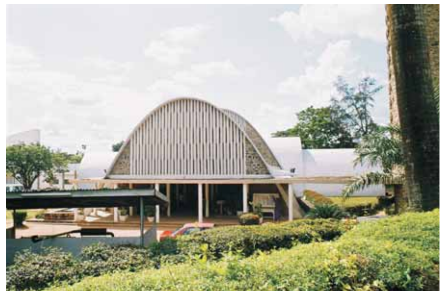
University of Ibadan, Ibadan. Anglican Chapel.