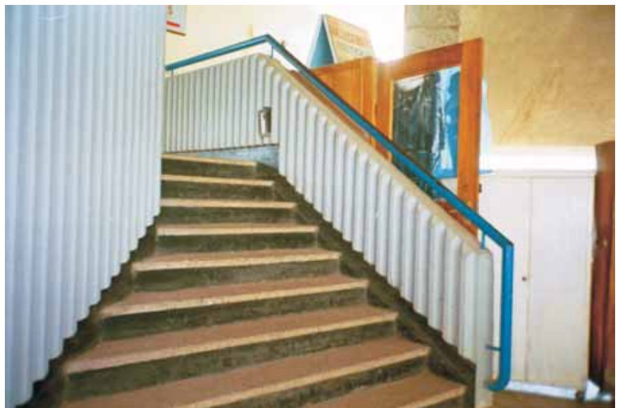
Obafemi Awolowo University, Ile-Ife. Conference centre, stair detail.