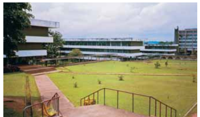
Obafemi Awolowo University, Ile-Ife. The Quadrangle with the Humanities Buildings.