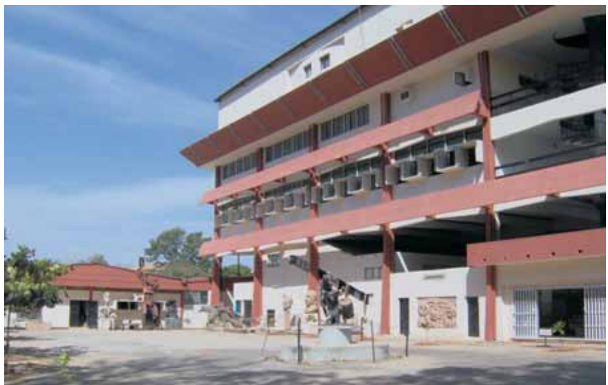
Ahmadu Bello University, Zaria.