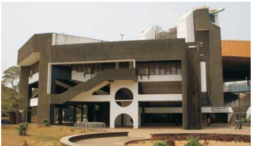
Obafemi Awolowo University, Ile-Ife. Oduduwa Hall.