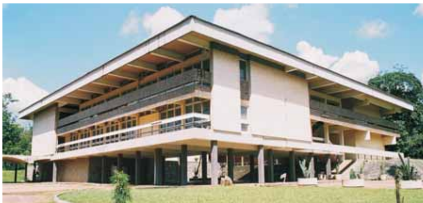
University of Ibadan, Ibadan. Department of Nursing.

The Department of Nursing (1967) by Design Group Nigeria creates a very peaceful atmosphere. The most pleasurable is the small courtyard with a stone wall on one side and representative stairs. Traditional building materials such as wood and stones used for wall finishes and balustrades classify the building to the regional trend. The design is well adapted to the weather. The wind penetrates through the building across the open staircase and through the balcony which extends to form a kind of window to the surrounding environment.