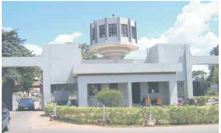
University of Ibadan, Ibadan. Entrance gate..