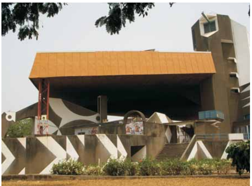
Obafemi Awolowo University, Ile-Ife. Oduduwa Hall.