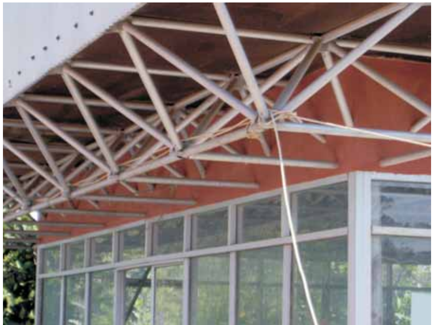
Ahmadu Bello University, Zaria. Department of Architecture, roof studio detail. Source: author's photograph, 2005.