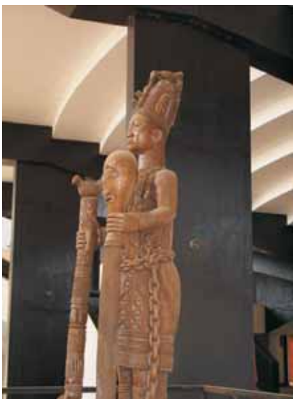
Obafemi Awolowo University, Ile-Ife. Oduduwa Hall.