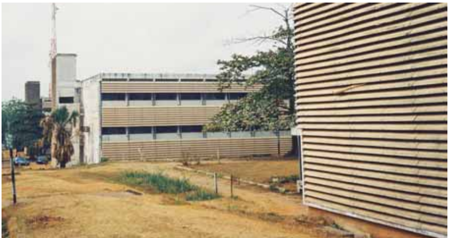
Obafemi Awolowo University, Ile-Ife. Faculty of Science.