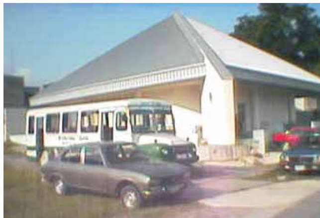
Berger Conference Centre.