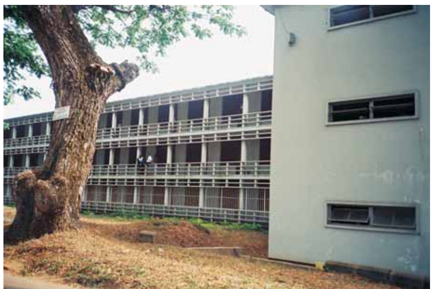
University of Ibadan, Ibadan. Student's hostel.