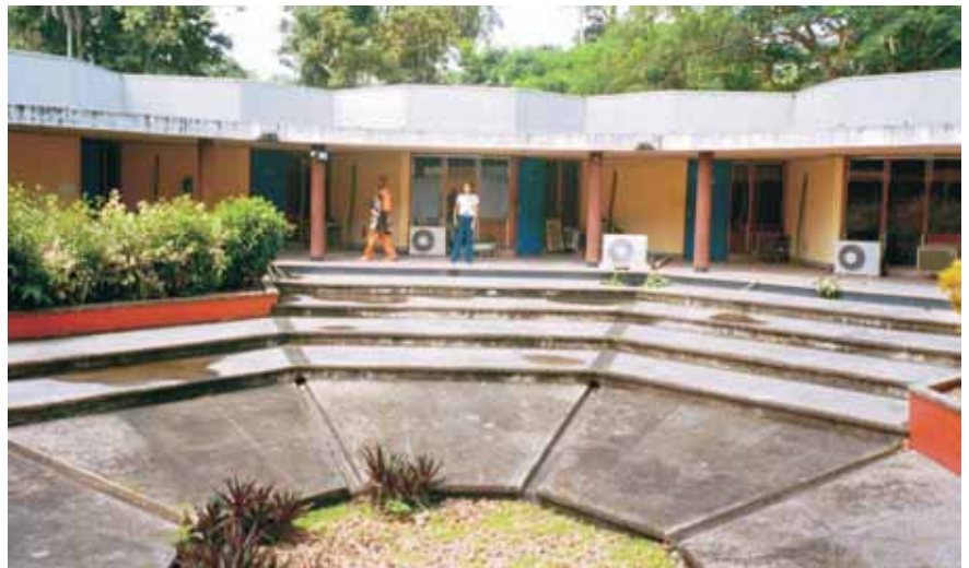
Obafemi Awolowo University, Ile-Ife. Conference Centre Courtyard.