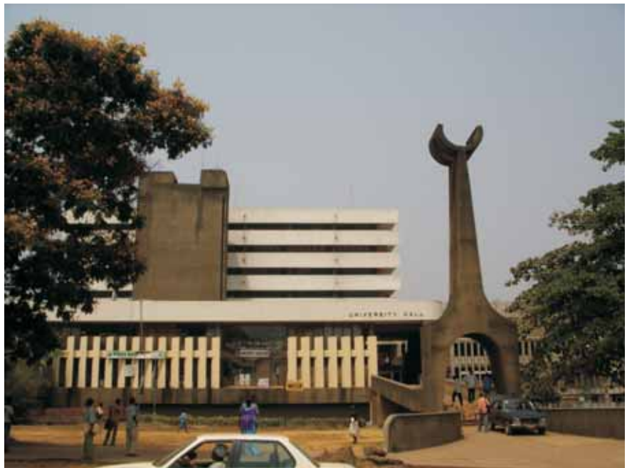
Obafemi Awolowo University, Ile-Ife. University Hall.