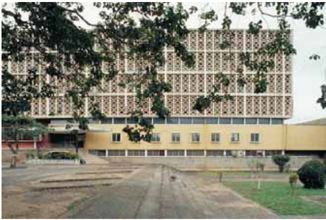
University of Ibadan, Ibadan. University Library.