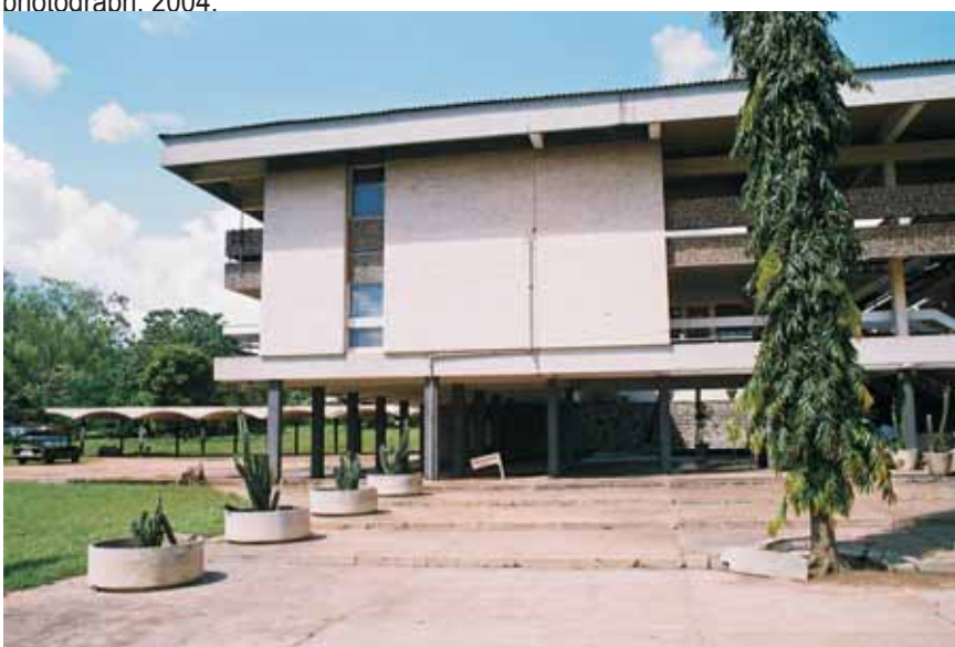
University of Ibadan, Ibadan. Department of Nursing courtyard.